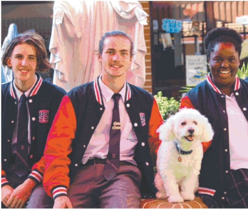
McCarthy College Year 12 students with their new chat and pat dog Max.

MCCARTHY College has become the only school in the Catholic Education Diocese of Parramatta (CEDP) with a "chat and pat" dog